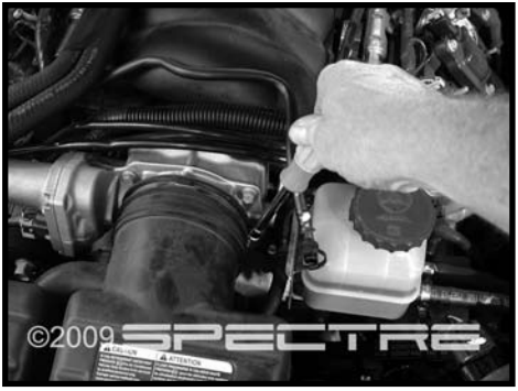
Step 3 Once the engine cover is removed, loosen the clamp on the stock air intake around the throttle body.

Step 2 Remove the oil cap to allow you to remove the plastic engine cover. Remove the cover and reinstall the oil cap to ensure that nothing falls into the engine while you are working.