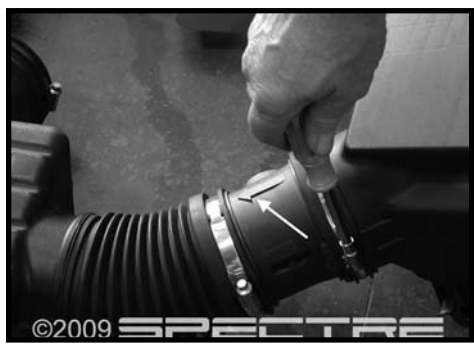
Step 10 Remove Mass Air Flow Sensor (MAFS) from the stock intake system. Note the arrow on the sensor indicating the direction of flow. The arrow must ALWAYS point towards the engine when installed on the vehicle.