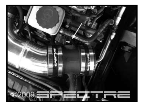
Step 12 Install 4" couplers (with clamps) on both sides of MAFS and install the assembly onto the intake tube as shown (ensure that the arrow is pointing towards the engine). Leave the clamps loose at this time.